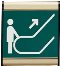
Available Dimensions for Inserts

Our exclusive Engraver's Sign System combines silver and gold aluminum shapes and injection-molded plastics into a unique system of interchangeable components for single signs and directories. Some assembly required. Simply engrave the inserts, snap into place, and your interior sign system is ready for installation.