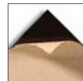
AlumaMark™ marked with an asterisk (*) includes an adhesive back