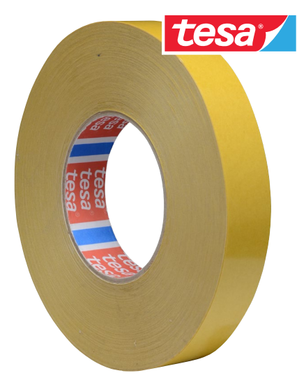
TESA® double-coated Super Tape